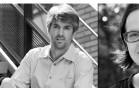
> Paris Dauphine

They have come from Oxford, Princeton, Cambridge, Paris Dauphine, New York and elsewhere to further enrich the reputation of TSE & IAST.