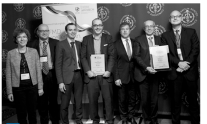
EDF & TSE delegation

The winners awarded during the EFMD's Executive Development Conference in Stockholm, Sweden 9-11 October